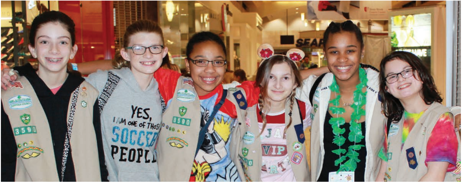
▲ Girl Scout Cadette Troop 3590 Stayed Up All Night at GSSC's Cookie Palooza 2018 at Smith Haven Mall! ▲