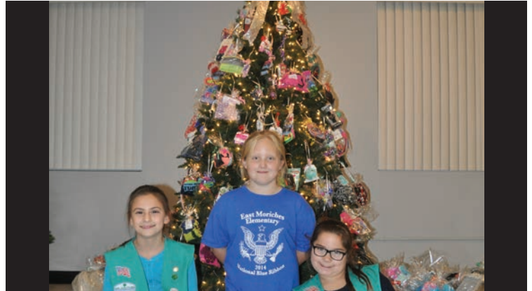
Tree-Mendous Hearts: Troops in Service Unit 65 donated a Giving Tree to GSSC's Hall of Trees. Troop 4000 assembled and decorated the tree with gifts for girls and boys in need.