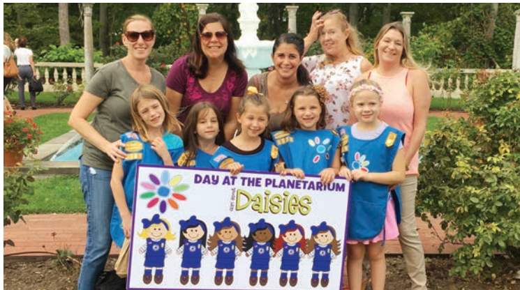
Rally Fun: Girls in Daisy Troop 1781 had a blast at GSSC's Fall Product Sale Rally at the Vanderbilt Museum & Planetarium.