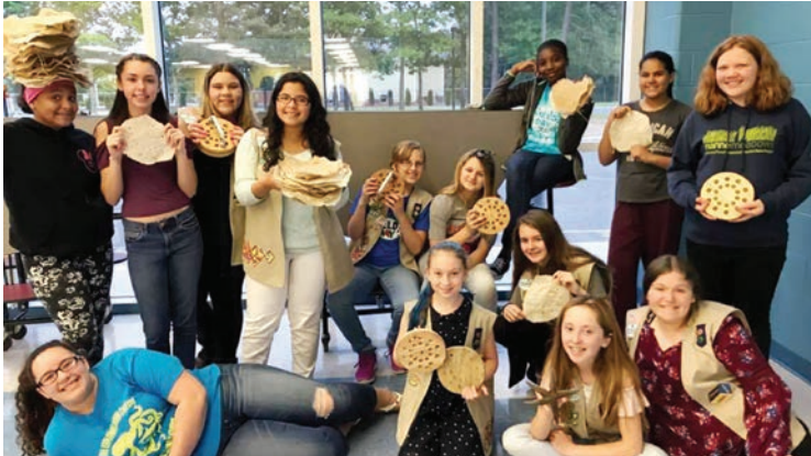
Eco-Importance: As part of their Breathe Journey, girls in Troop 159 hosted a workshop for SU 48, educating younger girls on the importance of eelgrass. They made more than 200 burlap tortillas for the CCE Marine Program to restore 2,000 plants to local bays.