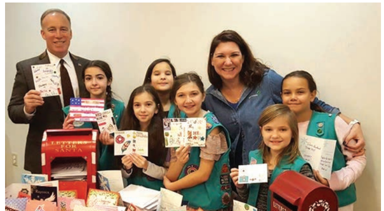
Remembering Servicemen & Women: For their Take Action project, Girls in Troop 995 organized a community card writing day for U.S. military troops.