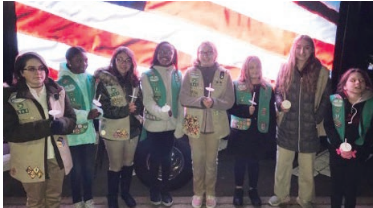
Officer Remembrance: Girls in troops 13 and 2140, SU 48, attended a vigil for fallen police officers. The vigil was held at Yaphank Police Headquarters to honor police officers slain in the line of duty.