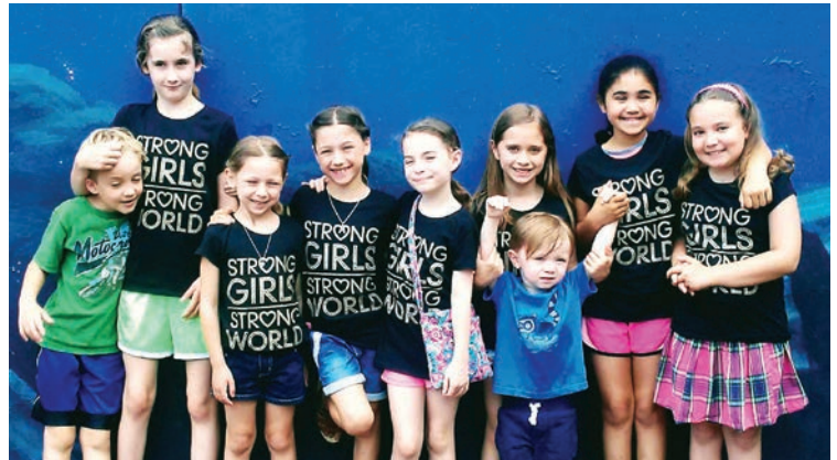
Aquarium Adventure: Girls in Troop 1684 used their cookie money to take a trip to the Long Island Aquarium. The trip coincided with their bridging to Juniors, and was a celebration for successfully completing two years.