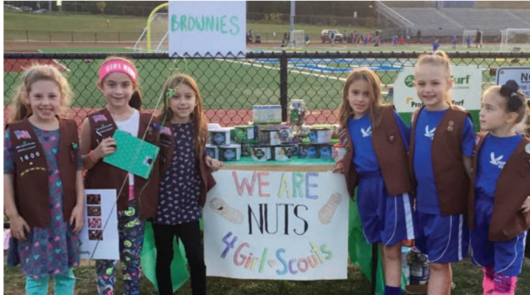
Savvy Soccer Sales: Girls in Brownie Troop 1606 took turns running a nuts booth sale and playing in their soccer game!