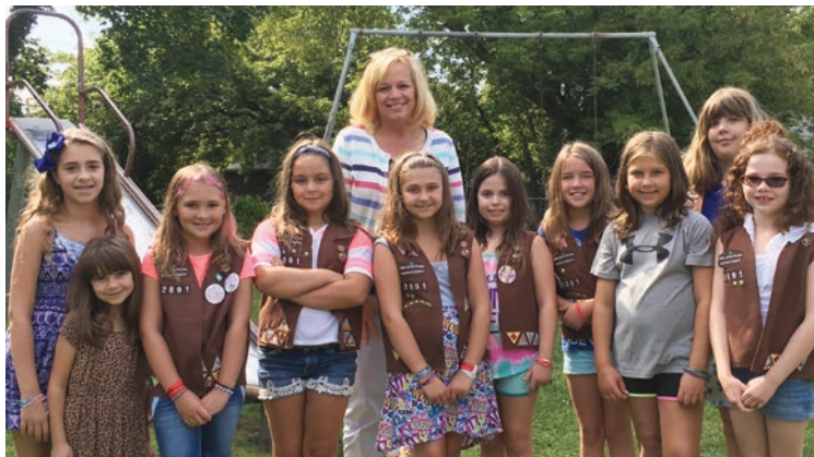
Flower Power: Girls in Troop 2891 received approval and encouragement from their village to plant, paint and design flower boxes in an effort to improve one of their community parks.