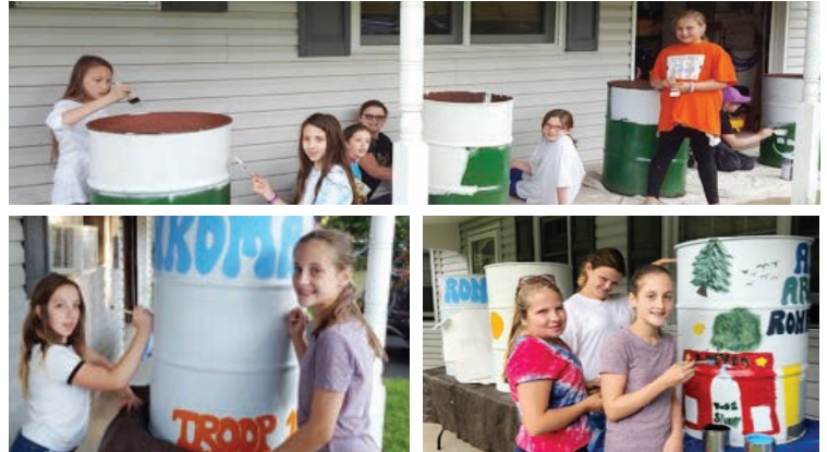
Keen on Clean: Girls in Troop 1631 volunteered to clean up around the Lake Ronkonkoma. They painted garbage receptacles to encourage visitors to keep the area clean.