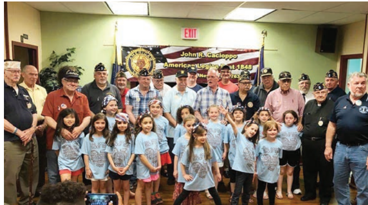
Remembering Veterans: Girls in Troop 1030 performed, made crafts, and served dinner to veterans at Medford VFW post 2937. The girls began an initiative to create Operation Restore VFW , which is supported by local legislators.