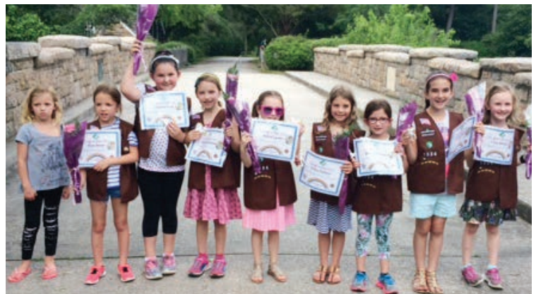
Brownie Bridging: Girls in Troop 1534 bridged from Daisies to Brownies on the Frank Melville Memorial Park Bridge in Setauket.