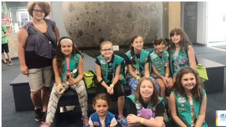
Fall Rally Fun: Girls in Troop 2091 had a blast at the Fall Product Sale Rally at Vanderbilt Planetarium.