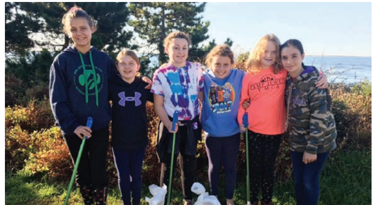
Beachy Clean: Girls in Junior Troop 1556 worked hard to clean up Webby's Beach in Center Moriches.