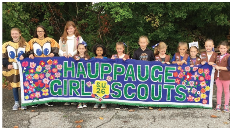
Showing Spirit: Girls in SU 26 proudly carried their Girl Scout banner and wore GS cookie costumes in the Hauppauge Homecoming parade.