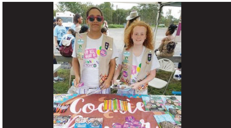
Helping Hands: Girls in Troop 314 participated in the Community Youth Expo CI's Salute to Brentwood .