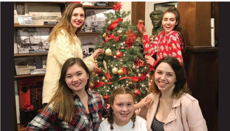
Decking the Halls for History: Senior Scouts from Troop 288 continued their annual tradition of donating handmade ornaments and decorating the Lake Ronkonkoma Historical Society for the Holidays.