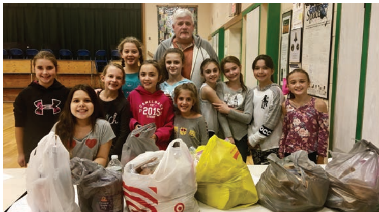
Community Helpers: Girls in Troop 343 made Sandwiches for distribution through the Wyandanch Soup Kitchen.