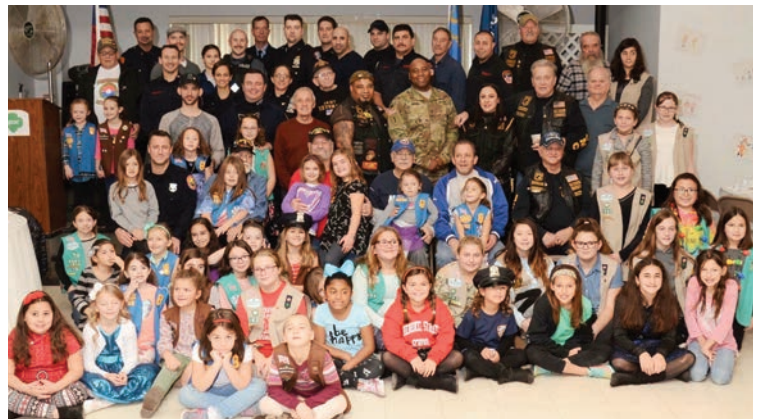
Honoring Heroes: Girls in SU 34 hosted a Heroes Brunch at Camp Edey to honor the men and women heroes who serve and have served in both the military and on the police force.