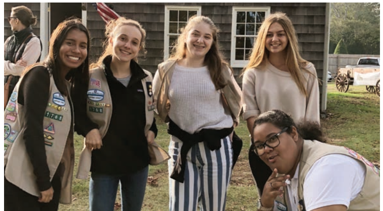
Farm Sleepover: Girls in Ambassador Troop 1768 of East Hampton attended a camporee at the East Hampton Historical Farm Museum.