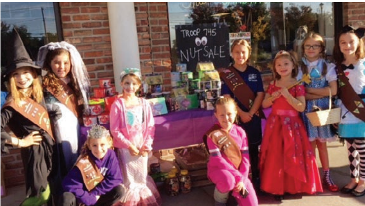
Spooky Booth Sale: Girls in Brownie Troop 745 held a spooky nut sale in October. Customers enjoyed seeing the girls all dressed up in their Halloween costumes!