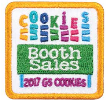
Cookie Booth Sale Patch