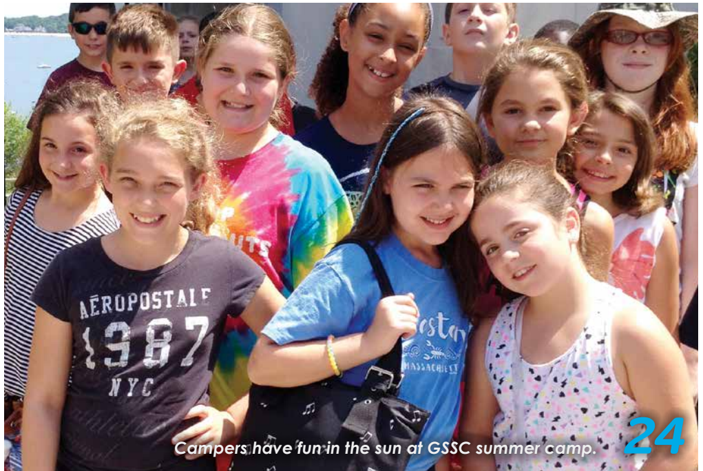
Campers have fun in the sun at GSSC summer camp.