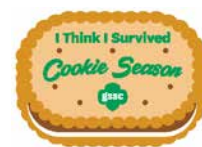
May 19 - 21 "I Think I Survived Cookie Season" Patch