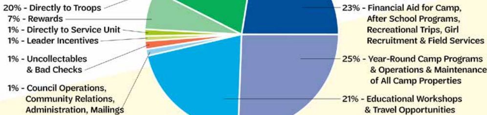
$4.00/Box = $1.02 to Cookie Manufacturer & $2.98 to Girl Scouts in Suffolk County

too. The cookies sold at a Booth Sale should be equally divided among all Girl Scouts who participate in the Booth Sale. The girls can then use those cookie points toward receiving the award(s) that they want. Hosting Booth Sales also gets you closer to making the 21st Century Super Troop Award.