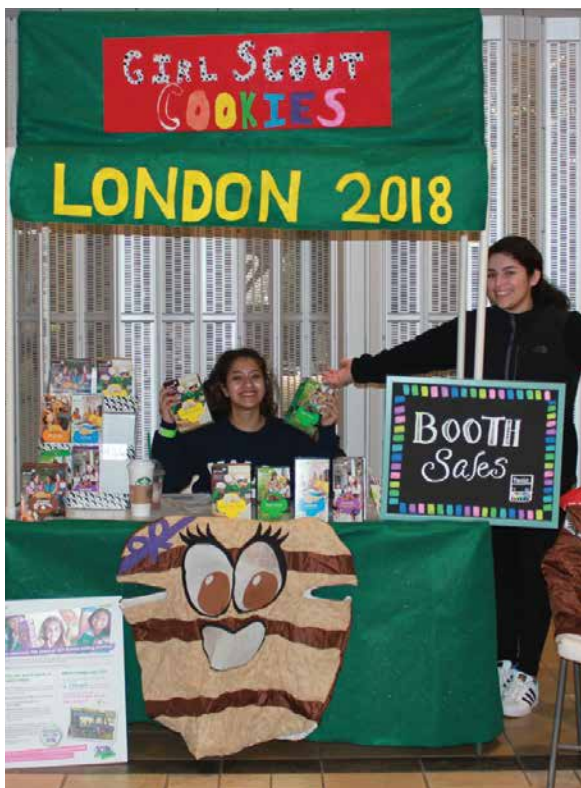
Troop 2305 displays its London-bound booth sale strategy at Cookie-Palooza 2017.

Adds Gail, "Never give up on your dreams!"