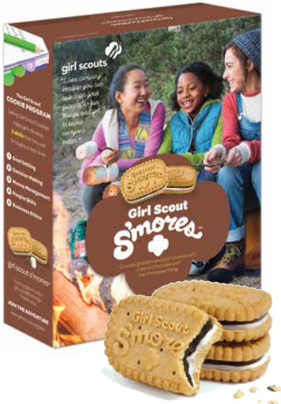
Presenting the NEW Girl Scout S'mores Cookie!