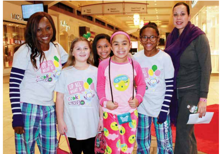
Pictured: Girl Scouts from Cookie-Palooza 2017 wearing the event t-shirt, pj bottoms and arm bands.

It was an evening of festivities, friendship and fun at GSSC's Cookie-Palooza sleepover at Smith Haven Mall. More than 1,500 Girl Scouts and volunteers turned out to celebrate at this sold-out event with special activities, a fashion show, dance party, shopping and more.